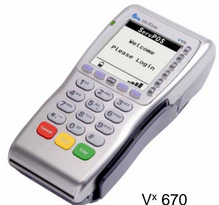
V x 670